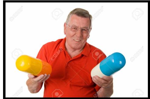
Learn to defend yourself with 2 comically sized pills

mother answered many questions that they had and it also brought the three siblings some closure about their past. Best of all it brought the 3 siblings together.