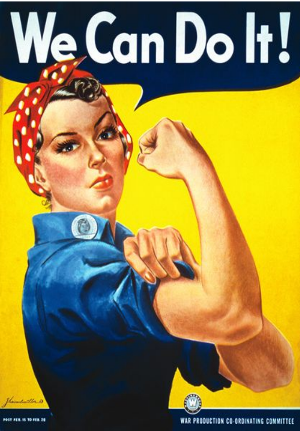
More Feminine Version

Both created by: Norman Rockwell in 1942