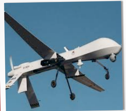
UNMANNED AIRCRAFT: THE WHOLE STORY