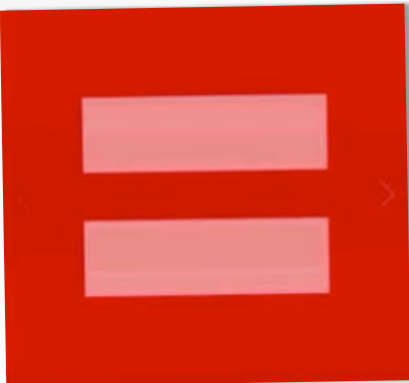
THE GAY MARRIAGE DEBATE