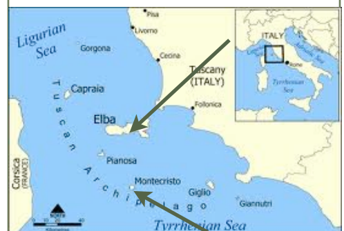
A map of the Tuscan Archipelago, including the Isles of Elba, where Napoleon was exiled and to where Dantés delivered a letter to, and Monte Cristo, where the immense treasure Dantés acquired was stored. He also named himself after it, the Count of Monte Cristo.

I could relate to some things in the story, but not