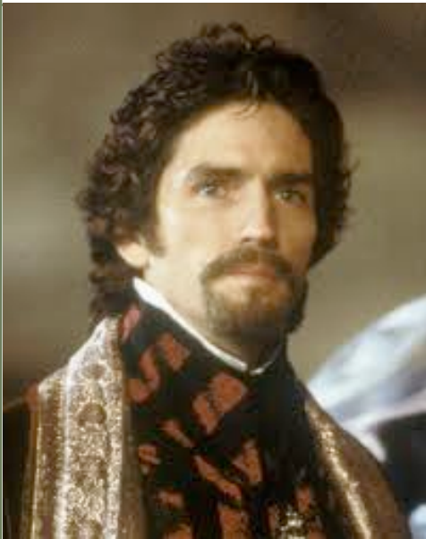
Edmond Dantés, as portrayed in the 2002 movie by James Caviezel

immense treasure on the Isle of Monte Cristo, and then dies of a seizure. Edmond escapes in the Abbé's body bag and collects the treasure on Monte Cristo. Before focusing on revenge, however, Dantés helps some of the few people that were kind to him before his imprisonment. He gives a diamond to Caderousse, a former friend, now almost bankrupt, in exchange for information about Fernand, Danglars, and Villefort, whom are all rich and in Paris. Fernand is now the Count of Morcerf and married to Mercedes, Danglars now a Baron and millionaire, and Villefort now the Crown Prosecutor. The diamond becomes Caderousse's ruin, though, when his wife kills the merchant who had just bought