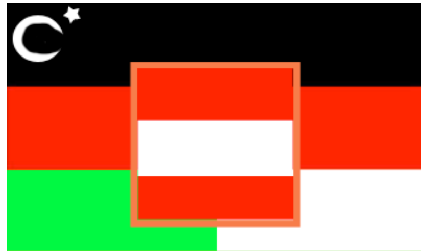
New World Flag

To ease the massive economic recession facing the countries, the former central powers countries form a new empire: New World Empire.